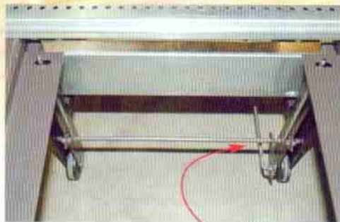
Interkal Quality: Heavy-Duty Engagement Rod Linkage provides positive engagement at both front and rear, resulting in a highly durable and reliable system.