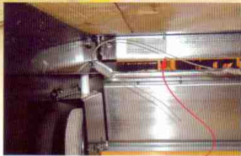
Hussey Compromise: Cables have excessive slack and exposed lead splices can easily fail.

Interkal Double Recoverable Notch shown here