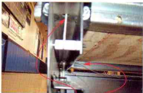
Hussey Compromise: Cables are laced up and around steel components, making them susceptible to binding or breaking.